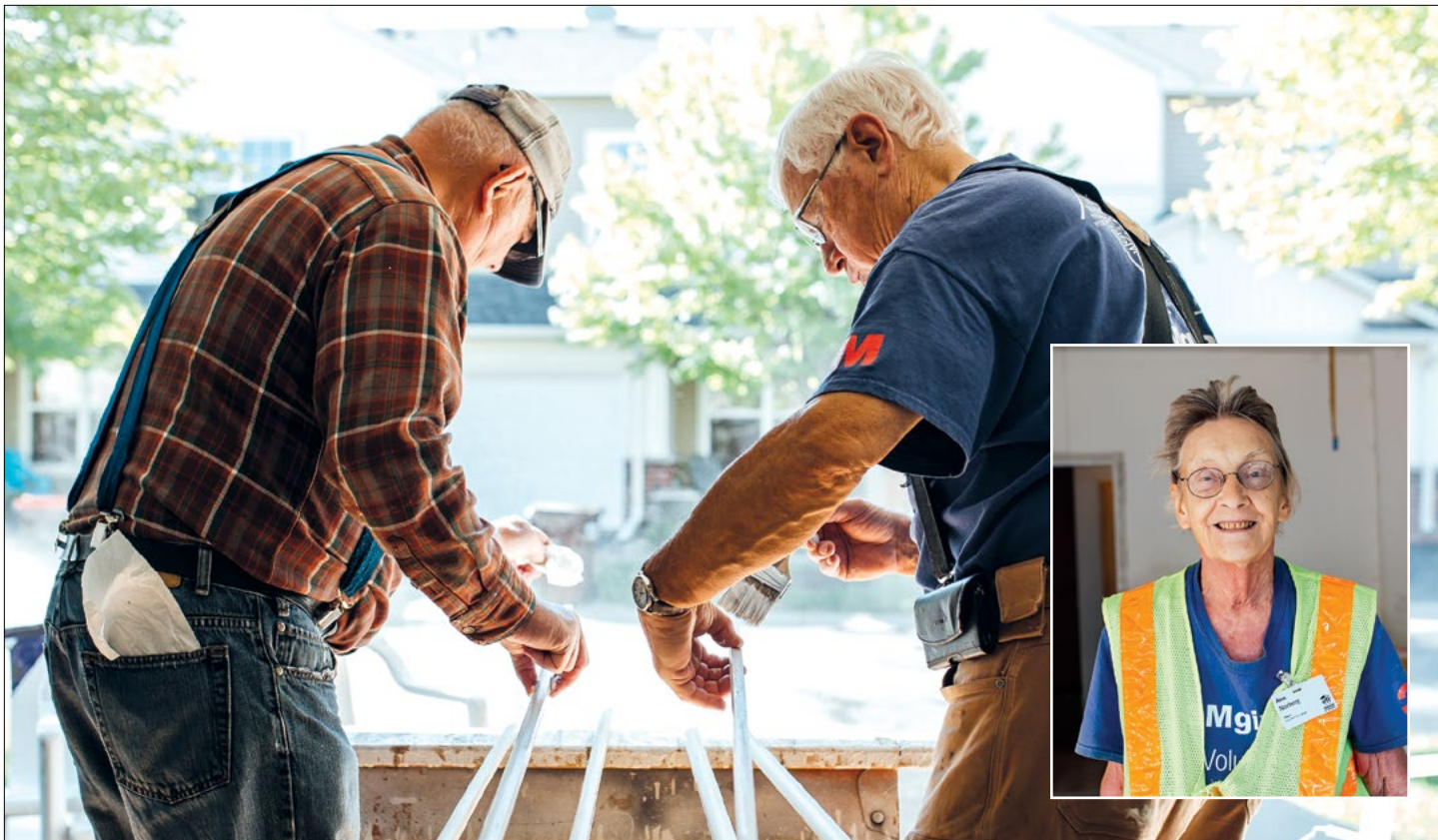
Above and inset: Members of the 3Mgives regular crew work on a home in Woodbury. There are 18 regular crews in the Twin Cities ready for you to join—or you can start your own!