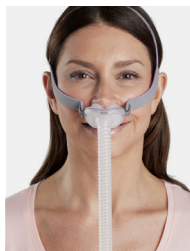
Nasal Pillow Mask