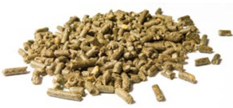
DEHYDRATED SILAGE CORN