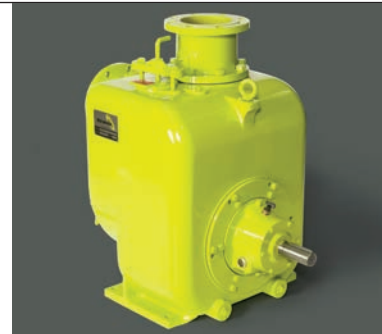
The Remko RTH150 Hi-Pressure Trash Pump

Dependable self priming performance makes the RTH Series Pumps ideally suited for industrial applications including mine dewatering, trade waste, metal and timber mills, road construction, food and chemical processing plants.