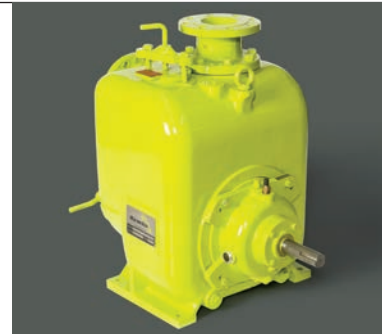
The Remko RTH100 Hi-Pressure Trash Pump

Dependable self priming performance makes the RTH Series Pumps ideally suited for industrial applications including mine dewatering, trade waste, metal and timber mills, road construction, food and chemical processing plants.