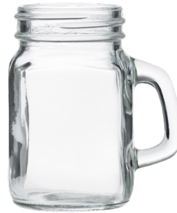
FK209 Mason Jar with Handle (4 ¾ Oz.) 1 Dz.