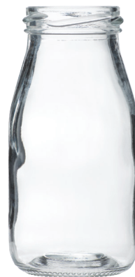
FK213 Milk Jar (6 ¾ Oz.) 1 Dz.