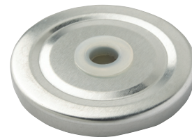
FL108 Milk Jar Lid with Hole 1 Dz.