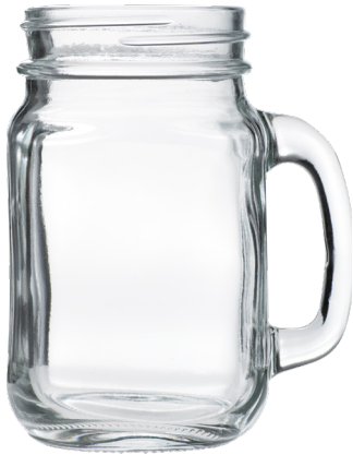
FK203 Mason Jar with Handle (16 ½ Oz.) 1 Dz.