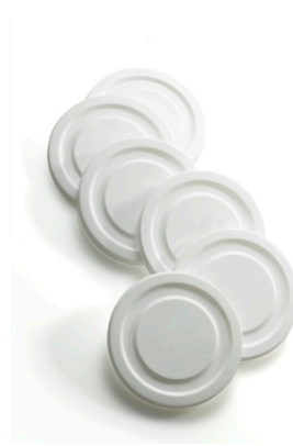
N2513 Lids (fits 13297, 53195) 48 Pcs.