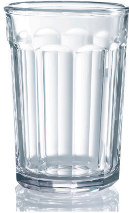
53195 Cooler (21 Oz.) H: 5 1/2" T: 3 13/16" M: 3 13/16" B: 3 1/4" 1 Dz.