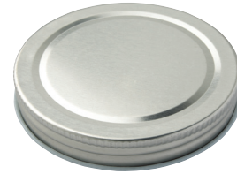
FL012 Mason Jar Lid (fits FK206, FK203) 1 Dz.