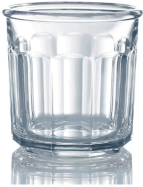
13297 Double Old Fashioned (14 Oz.) H: 4" T: 3 5/8" M: 3 5/8" 1 Dz.