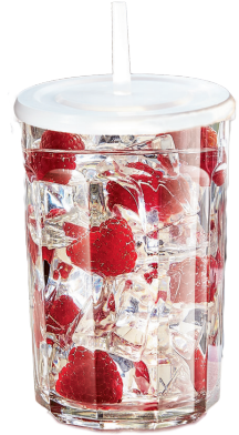
L0996 Straw and Lid ONLY (fits 53195) 64 Pcs. (32 Lids and 32 Straws)