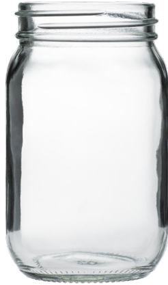
FK206 Mason Jar Non-Handle (15 ¼ Oz.) 1 Dz.