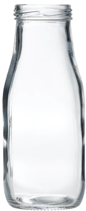
FK212 Milk Jar (10 ¾ Oz.) 1 Dz.