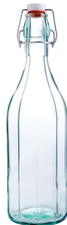
FJ016 Swing Top Bottle (25 1/4 Oz.) 6 Pcs.