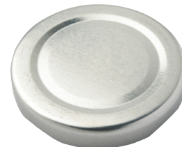
FL014 Milk Jar Lid 1 Dz.