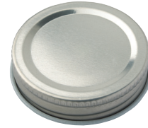
FL013 Mason Jar Lid (fits FK209) 1 Dz.