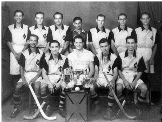
Group photograph of the winning Harlequins Hockey Team. 1943.