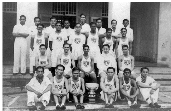
Raffles College athletics team. 1938.