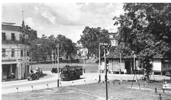
Junction of Prinsep Street with Bras Basah Road. On the right is the former Ladies Lawn Tennis Club premises which had been acquired by Young Men's Christian Association (YMCA) in 1932 after the club's closure. In the background is the Raffles Museum and Library. 1930s.