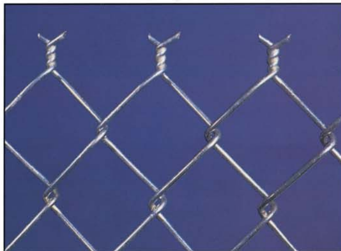
Right: GAW fabric. The GAW process guarantees that cut ends will be coated with the same quality material and protection as the rest of the fabric. The pre-coated process provides no such guarantee.