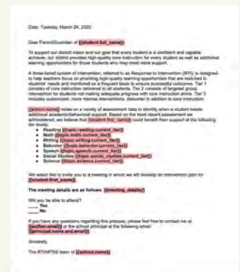
Sample family communication template

Branching Minds also allows teachers to generate Student Intervention Reports that pull together all of the work that has been done to support a student as well as the charts and graphs displaying student progress. These communications and Intervention Reports can also be created for many students at once, saving teachers even more time and effort when creating updates for families.