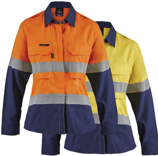
Orange / Navy Yellow / Navy

TORRENT HRC2 LADIES HI VIS TWO TONE OPEN FRONT SHIRT WITH GUSSET SLEEVES AND FR REFLECTIVE TAPE