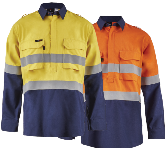
Yellow / Navy Orange / Navy

TORRENT HRC2 MENS HI VIS TWO TONE CLOSE FRONT SHIRT WITH GUSSET SLEEVES AND FR REFLECTIVE TAPE