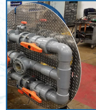
Discharge with Bypass Port