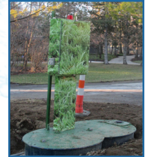
Stainless Steel Panel Stand