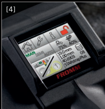
[4] Settings menu