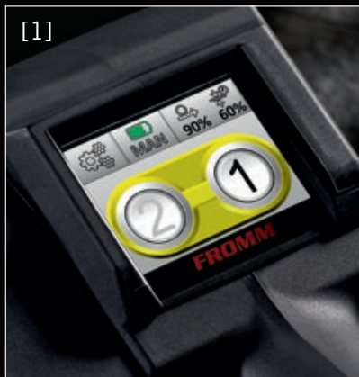
[1] Classic mode

Easy to operate with factory gloves of all kinds!