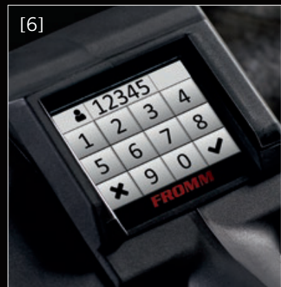
[6] Locking of the Tool settings