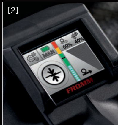
[2] Advanced mode