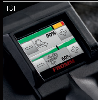
[3] Tension force and Welding time