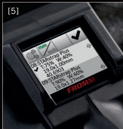
[5] Strap database