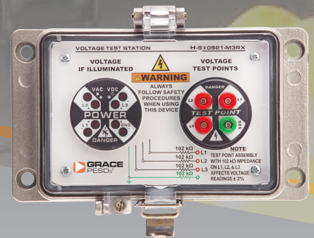
Fully assembled Knockout Voltage Test Station H-S10S21-M3RX