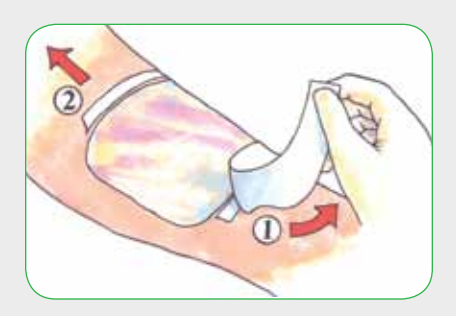
Position the dressing and firmly smooth it onto the skin. Remove the paper frame. Remove the two white paper side tabs.