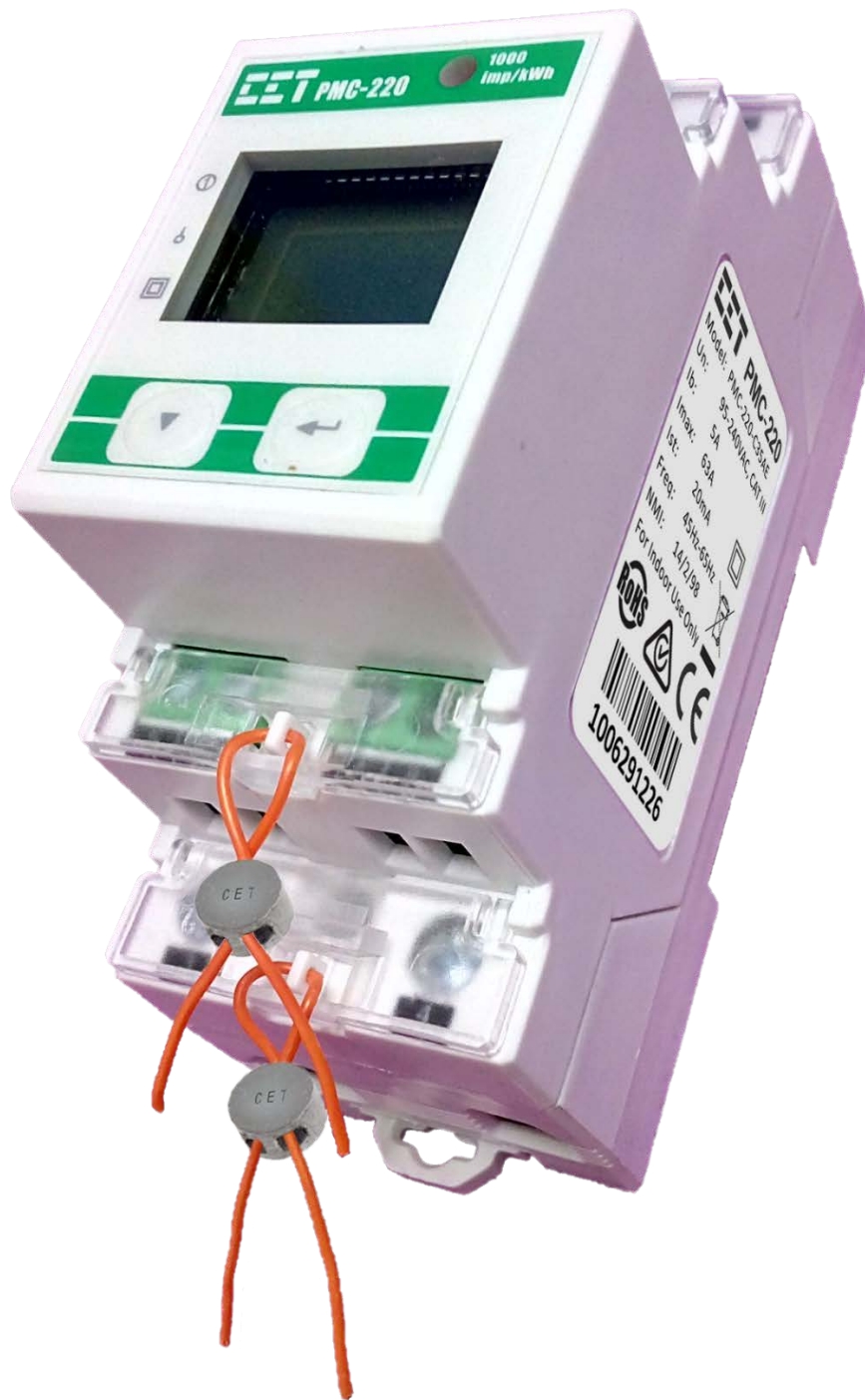
Ceiec Electric Technology Inc model CET PMC-220-C35AE Electricity Meter Including Typical Mechanical Sealing