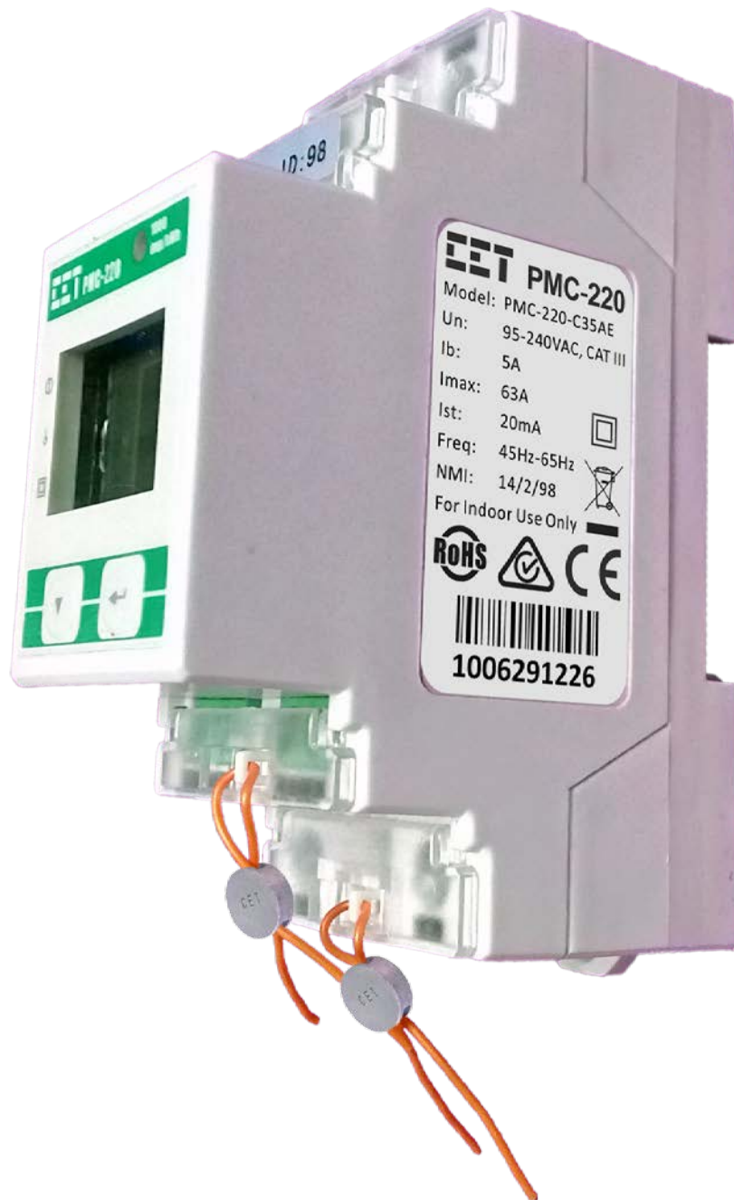
Ceiec Electric Technology Inc model CET PMC-220-C35AE Electricity Meter Showing Markings