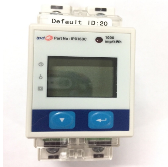
Variant 1 - Ceiec Electric Technology Inc model IPD 163C Electricity Meter