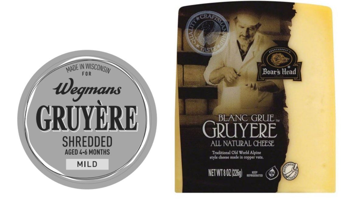
Dkts. 66-A, 72-4 at 32.

Plaintiffs also argue that defendants "provide no evidence as to the sales levels" of various cheeses produced outside the Gruyère region of Switzerland and France which are sold labeled as GRUYERE . This claim is flatly wrong. The record contains annual sales data from various cheese producers and retailers in the United States, including Wegmans, see Dkt. 72-4 (showing annual sales of Gruyerse ), Boar's Head, see Dkts. 82, 83 (showing sales of Gruyerse ), and Glanbia, see Dkts. 81, 81-A (showing annual sales of Gruyerse ) of domestic GRUYERE ), and Glanbia, see Dkts. 81, 81-A (showing annual sales of Gruyerse ) of domestic GRUYERE ), and Glanbia, see Dkts. 81, 81-A (showing annual sales of Gruyerse ) of domestic GRUYERE in the United States, this argument fails as market share not provided the exact market share of cheese produced outside the Gruyère region of Switzerland and France sold as GRUYERE in the United States, this argument fails as market share evidence is not required to establish genericness. Plaintiffs cite no case in support of the claim that market share evidence is required, and no such case exists. Further, the evidence provided by defendants, which includes import