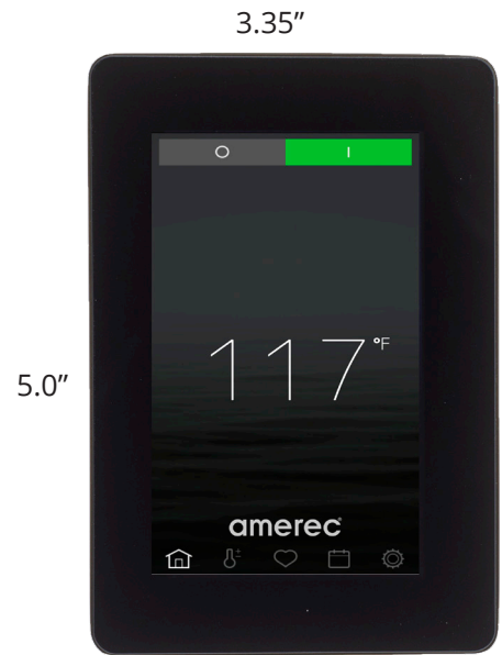
Elite Cloud Touch Screen Control

Refer to specific installation instructions for further detail.