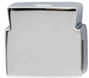
ComfortFlo Steam Head