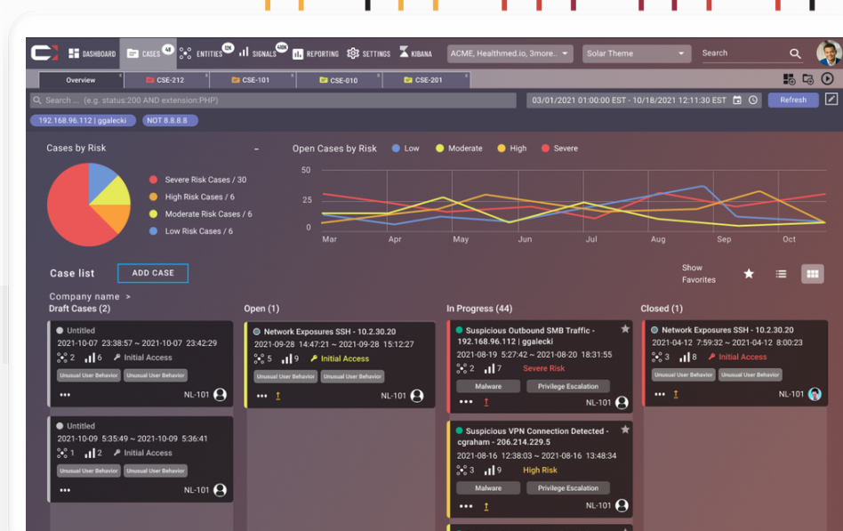
(1) 2021 IBM/Ponemon Institute Cost of a Data Breach Report