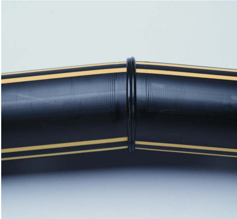
Figure A-1. Visually unacceptable mitered joint

Visually mitered (angled, off-set) joints should be cut out and re-fused (straight or coiled pipe).