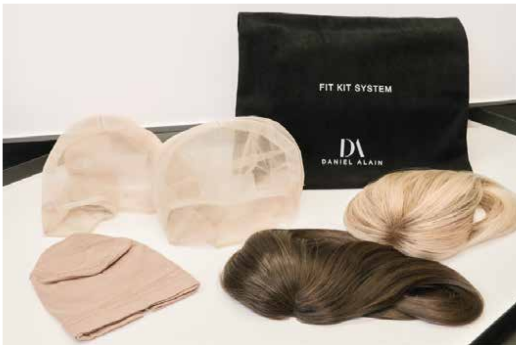
Follea by Daniel Alain Fit Kit