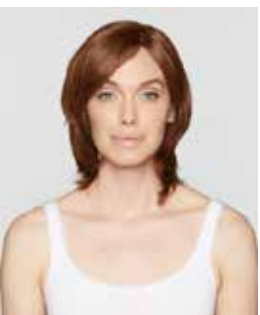
Daniel Alain 6" Wig