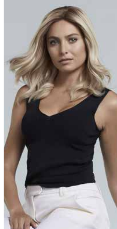
Model wearing Daniel Alain GripperLite Vienna - 11035, 10 LY

Medium length wigs generally fall around the shoulders. Medium length wigs are an excellent option that combines comfort and style. A medium-length wig frames the face beautifully and offers a range of styling choices. For example, you can easily style this length wig in a ponytail or half-up, half-down without spending hours styling. A synthetic medium length wig is more lightweight than a long wig.