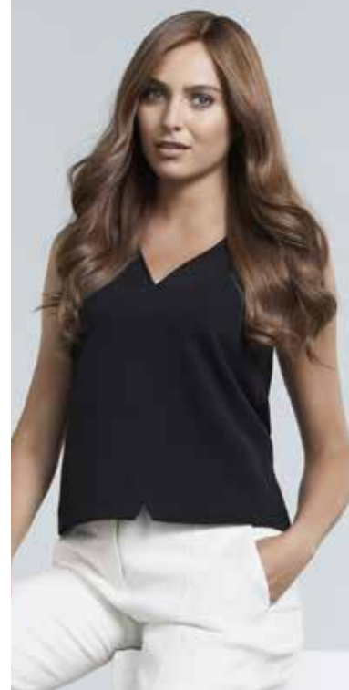
Model wearing Daniel Alain Grandeur Duchess - 3080, 16 LY

Often depicted as the benchmark for perfect hair, long wigs are beautiful, yes, and higher-maintenance. Long wigs fall past the shoulders and drape around the mid-back to about 16" or more. While the look is gorgeous, this length is more prone to tangling. The benefit is that long wigs offer optimized styling and versatility. It's important to consider that a long synthetic wig will add the most weight and heat, creating a more bothersome wearing experience. The enhanced weight and warmth of a synthetic can lead to headaches, itching, and discomfort. For this reason, we recommend first-time wig wearers wanting long hair to start with a human hair wig, which is lighter and more comfortable. If you'd rather wear a synthetic, you might want to opt for a short to medium-length wig and slowly transition to longer wigs.