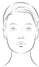
Rectangle Or Oblong

Your face shape may influence what type of wig you choose, but it's not always a key factor. Face shape plays a more significant role with ready to wear synthetic wigs because they are pre-styled. For instance, someone with a round face may opt for a long wig for an elongating effect.