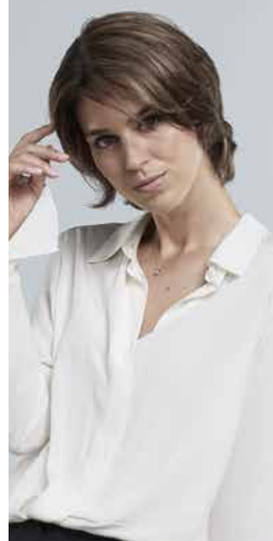
Model wearing Daniel Alain Pixie Macchiato - 5005, 5 LY

Frame the face and lay at the nape of the neck. Short wigs are lightweight, comfortable, and easy to style. Of course, if you're used to having long hair, you'll likely want to choose a longer length for your wig to retain continuity with your self-image. Even so, short wigs have notable benefits, especially for those experiencing hair loss from chemotherapy. Short wigs are light and easily maintained, which means you can wear them longer without discomfort. If your hair is in the regrowth phase after chemotherapy, a short wig can make the transition easier until your hair grows to the length you desire.