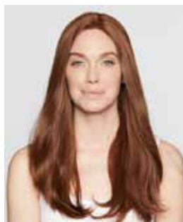
Daniel Alain 16" Wig

Choosing a hair length requires you to think about comfort, lifestyle, and style preference. There are three length categories - short, medium, and long - but each brand may have different length options.