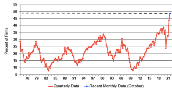
Unfilled Job Openings Percent with at Least One Unfilled Opening