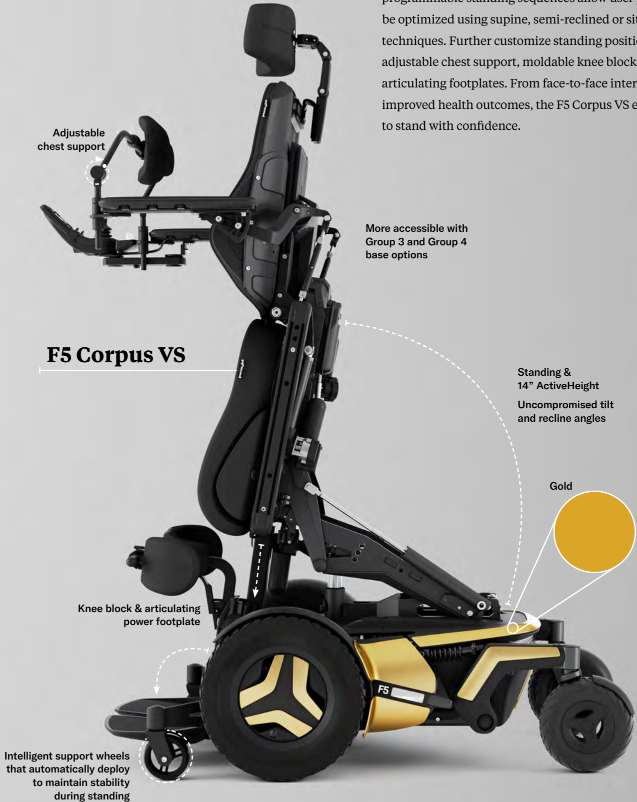
F5 Corpus VS

We combined all of the performance features of the F5 Corpus with superior power standing functionality. Fully programmable standing sequences allow user position to be optimized using supine, semi-reclined or sit-to-stand techniques. Further customize standing positions with adjustable chest support, moldable knee blocks and power articulating footplates. From face-to-face interactions to improved health outcomes, the F5 Corpus VS empowers you to stand with confidence.