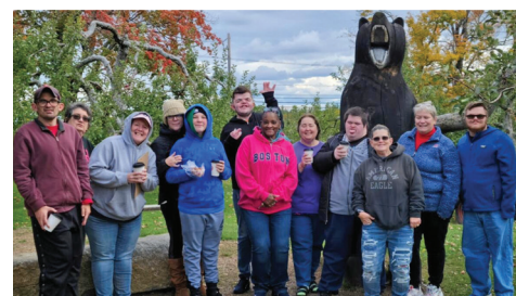
N. Quabbin apple picking

Seven Hills Family Services looks forward to the winter 2022 season, thanking the golfers and sponsors of the New Beginnings Charity Golf Tournament for helping to make it all possible!