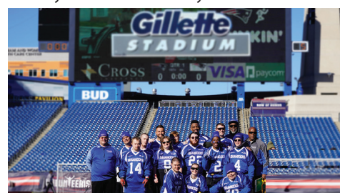
Rec Dept. SHF Shamrocks Flag Football