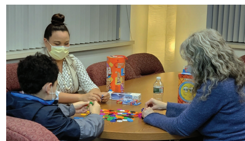
Greater Lowell FSC Fun Tuesdays