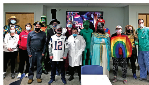
S. Valley FSC Halloween Party