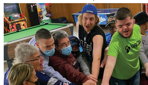
N. Central FSC Bowlathon