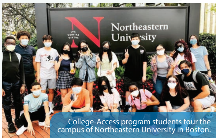
College-Access program students tour the campus of Northeastern University in Boston.

Seven Hills Foundation provides comprehensive educational services that meet the diverse needs of middle and high school students as well as young adults. From preparing promising students for college, to helping those who've dropped out of a traditional high school but want to complete their degree, young people are encouraged to see and achieve their potential.