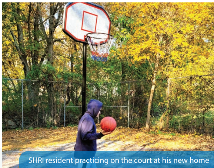
SHRI resident practicing on the court at his new home

The Commonwealth of Massachusetts Office of the Attorney General has awarded $44,000 to the Mediation program of Family Services of Central Massachusetts (FSCM) . Mediation provides an opportunity for involved parties to have a conversation that leads to an agreement outside of court. FSCM mediators are trained volunteers who provide high-quality, confidential facilitation of the conversation, but do not make suggestions or provide legal advice. Mediation services are provided free of charge or on a sliding fee scale to clients throughout the greater Worcester area.