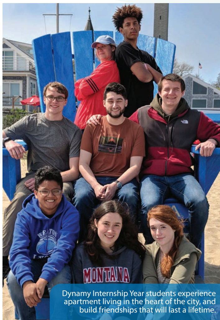
Dynamy Internship Year students experience apartment living in the heart of the city, and build friendships that will last a lifetime.