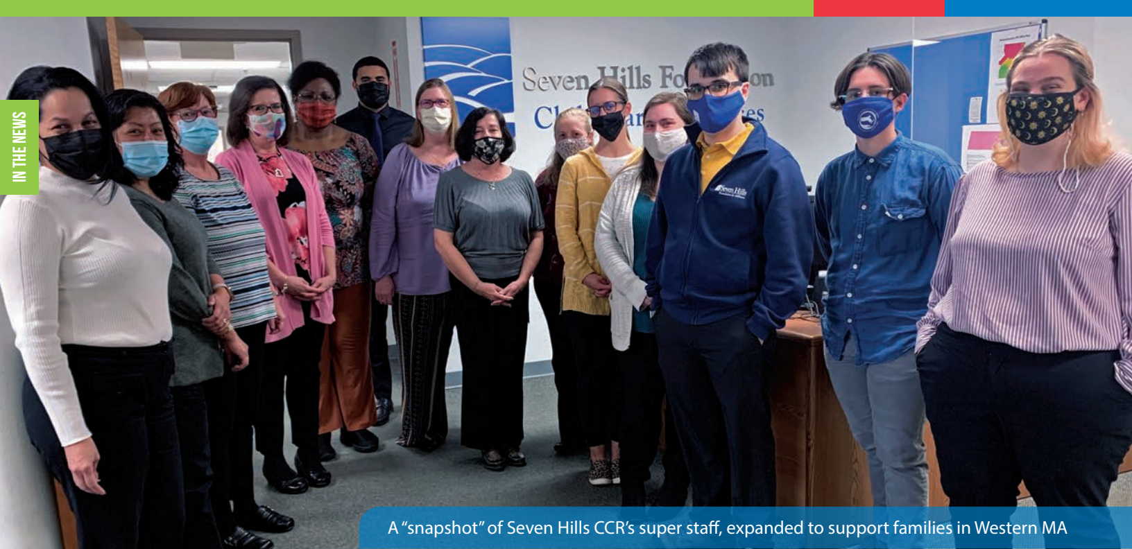
A “snapshot” of Seven Hills CCR’s super staff, expanded to support families in Western MA