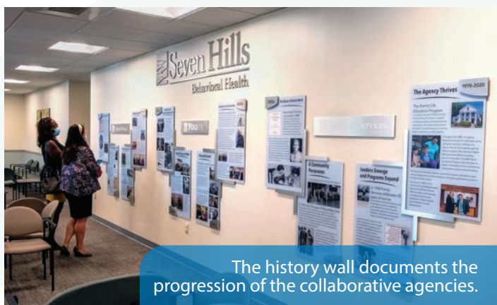
The history wall documents the progression of the collaborative agencies.