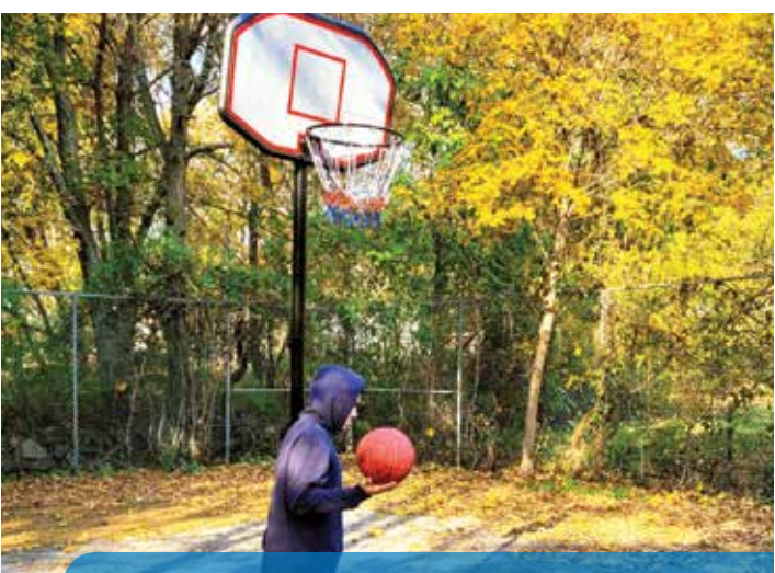
SHRI resident practicing on the court at his new home

The Commonwealth of Massachusetts Office of the Attorney General has awarded $44,000 to the Mediation program of Family Services of Central Massachusetts (FSCM). Mediation provides an opportunity for involved parties to have a conversation that leads to an agreement outside of court. FSCM mediators are trained volunteers who provide high-quality, confidential facilitation of the conversation, but do not make suggestions or provide legal advice. Mediation services are provided free of charge or on a sliding fee scale to clients throughout the greater Worcester area.