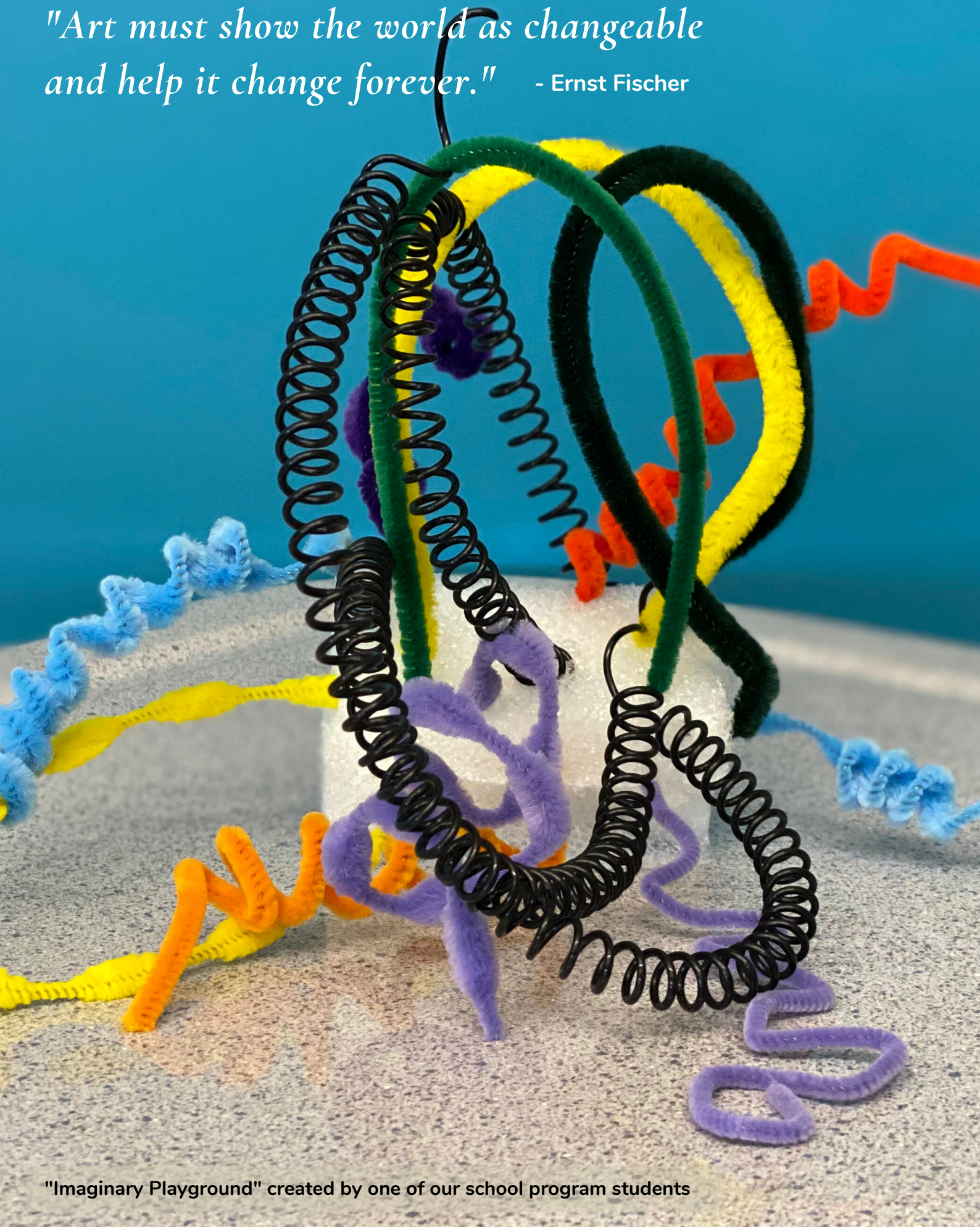
"Imaginary Playground" created by one of our school program students

"Art must show the world as changeable and help it change forever." - Ernst Fischer